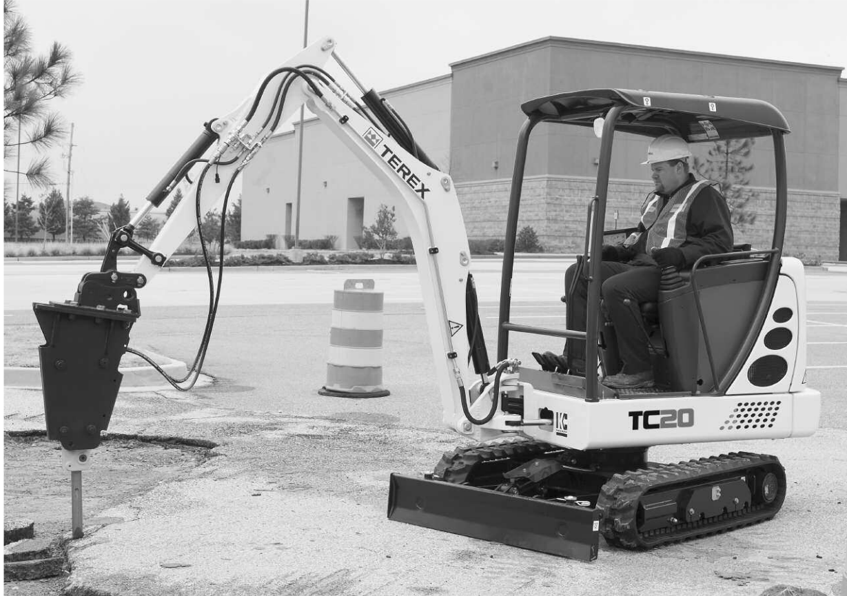
Unit shown with optional hydraulic hammer.